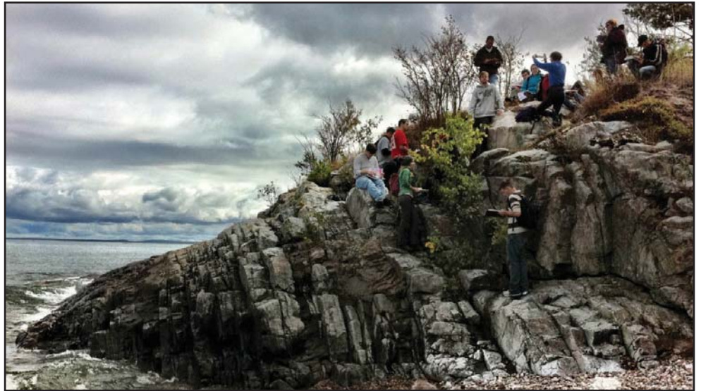
MSU geology students measure structural bedding and take field notes on deformed Precambrian quartzite exposed along the shoreline of Lake Superior during a weekend field trip last fall.

Like many programs at Michigan State, we are hopeful that we have moved beyond